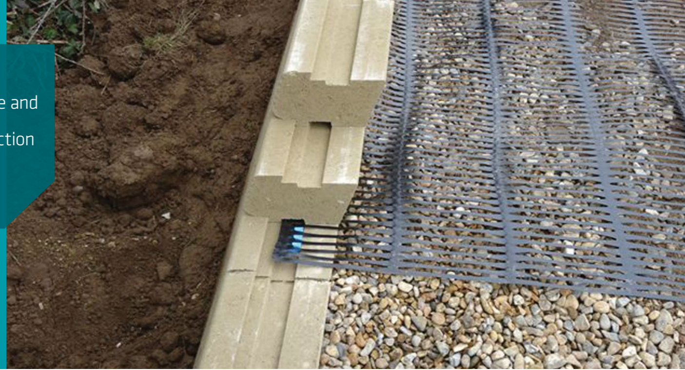
Positive high efficiency connection between the TensarTech SlopeLoc facing and Tensar geogrid.