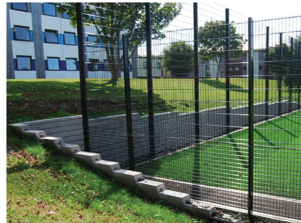
SlopeLoc system forming a 90° corner.