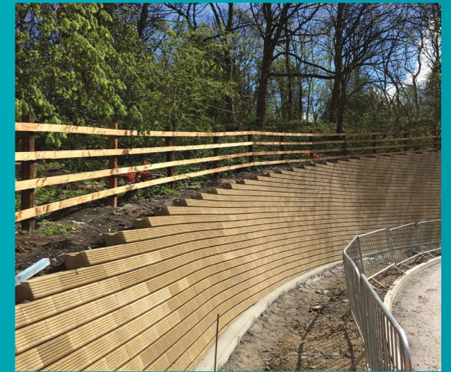
Rapidly installed and mortar free construction of the TensarTech SlopeLoc system.