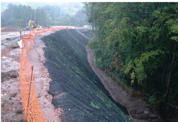
Heavy plant may work right up to the face.

efficient, accurate and timely Application Suggestions, assisting in scheme design from feasibility right through to construction.