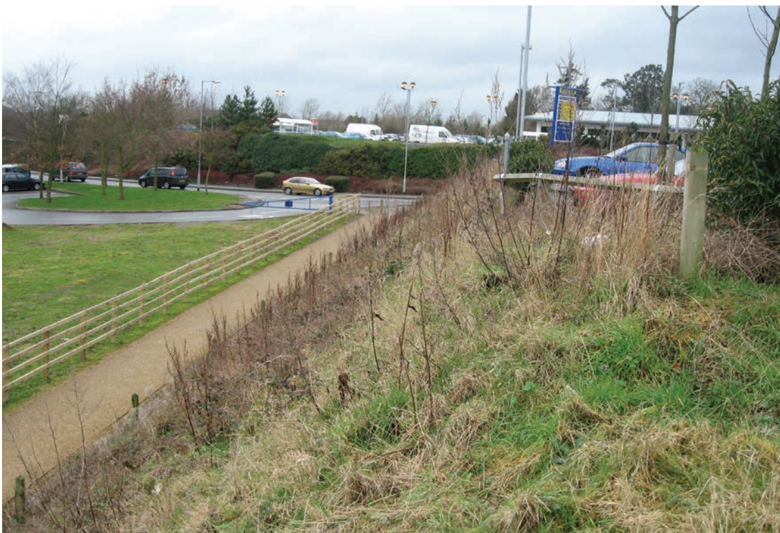
TensarTech™ NaturalGreen systems produce a face that is stable and steeper than an unreinforced slope, as well as being naturally attractive.

Savings of up to 75% over conventional construction methods such as reinforced concrete can be achieved by constructing with the TensarTech™ NaturalGreen System. In addition construction time may also be significantly reduced.