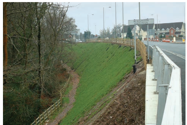
TensarTech™ NaturalGreen rapidly blends into the surroundings.